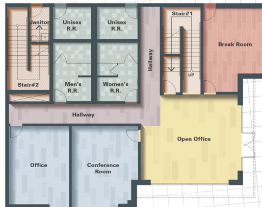
1ST FLOOR OFFICE AREA

The information contained in this communication is strictly confidential. This information has been obtained from sources believed to be reliable but has not been verified. NO WARRANTY OR REPRESENTATION, EXPRESS OR IMPLIED, IS MADE AS TO THE CONDITION OF THE PROPERTY REFERENCED HEREIN OR AS TO THE ACCURACY OR COMPLETENESS OF THE INFORMATION CONTAINED HEREIN, AND SAME IS SUBMITTED SUBJECT TO ERRORS, OMISSIONS, CHANGE OF PRICE, RENTAL OR OTHER CONDITIONS, WITHDRAWAL WITHOUT NOTICE, AND TO ANY SPECIAL LISTING CONDITIONS IMPOSED BY THE PROPERTY OWNER(S). ANY PROJECTIONS, OPINIONS OR ESTIMATES ARE SUBJECT TO UNCERTAINTY AND DO NOT SIGNIFY CURRENT OR FUTURE PROPERTY PERFORMANCE.